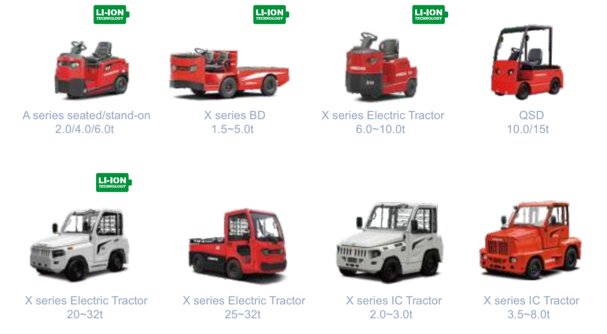
A series seated/stand-on 2.0/4.0/6.0t X series BD 1.5-5.0t X series Electric Tractor 6.0-10.0t QSD 10.0/15t X series Electric Tractor 20-32t X series Electric Tractor 25-32t X series IC Tractor 2.0-3.0t X series IC Tractor 3.5-8.0t