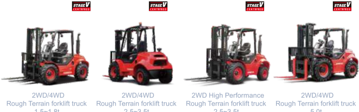
2WD/4WD Rough Terrain forklift truck 1.5-1.8t 2WD/4WD Rough Terrain forklift truck 2.5-3.5t 2WD High Performance Rough Terrain forklift truck 2.5-3.5t 2WD/4WD Rough Terrain forklift truck 5.0t