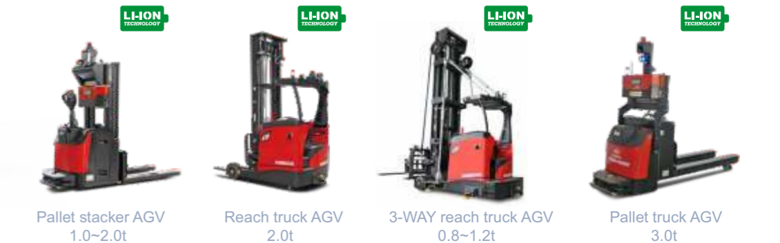
Pallet stacker AGV 1.0-2.0t Reach truck AGV 2.0t 3-WAY reach truck AGV 0.8-1.2t Pallet truck AGV 3.0t