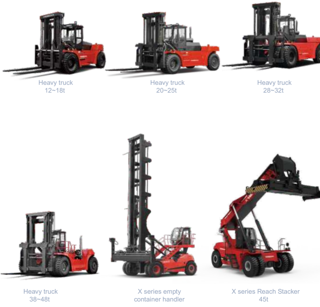
Heavy truck 12-18t Heavy truck 20-25t Heavy truck 28-32t Heavy truck 38-48t X series empty container handler X series Reach Stacker 45t