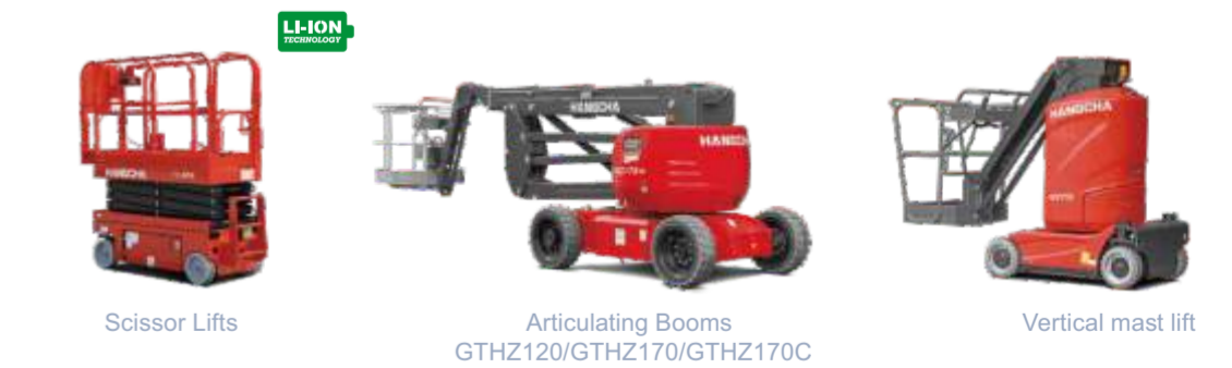
Scissor Lifts Articulating Booms GTHZ120/GTHZ170/GTHZ170C Vertical mast lift