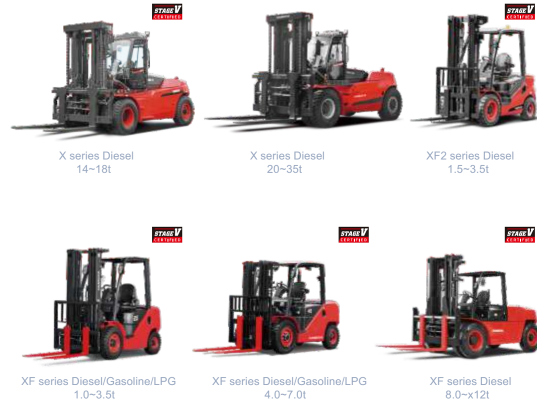
X series Diesel 14-18t X series Diesel 20-35t XF2 series Diesel 1.5-3.5t XF series Diesel/Gasoline/LPG 1.0-3.5t XF series Diesel/Gasoline/LPG 4.0-7.0t XF series Diesel 8.0-x12t