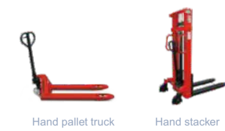
Hand pallet truck Hand stacker