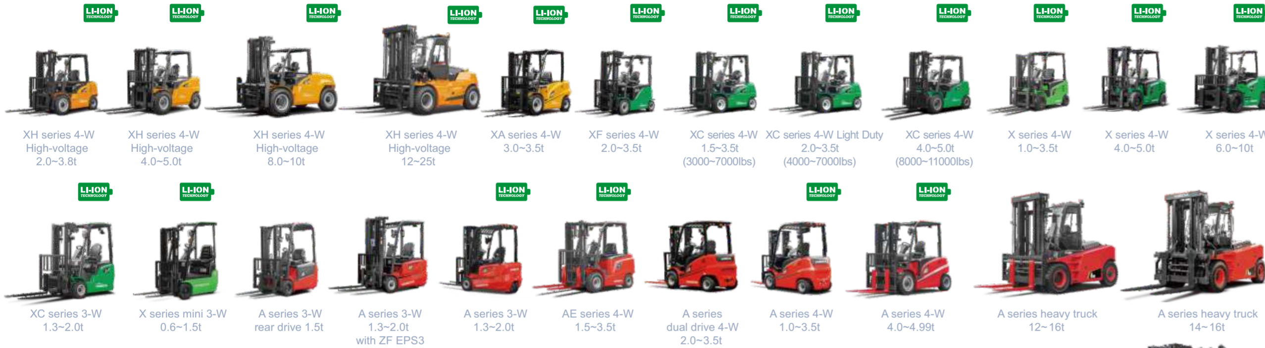
XH series 4-W High-voltage 2.0-3.8t XH series 4-W High-voltage 4.0-5.0t XH series 4-W High-voltage 8.0-10t XH series 4-W High-voltage 12-25t XA series 4-W 3.0-3.5t XF series 4-W 2.0-3.5t XC series 4-W 1.5-3.5t (3000-7000lbs) XC series 4-W Light Duty 2.0-3.5t (4000-7000lbs) XC series 4-W 4.0-5.0t (8000-11000lbs) X series 4-W 1.0-3.5t X series 4-W 4.0-5.0t X series 4-W 6.0-10t XC series 3-W 1.3-2.0t X series mini 3-W 0.6-1.5t A series 3-W rear drive 1.5t A series 3-W High-voltage 1.3-2.0t with ZF EPS3 A series 3-W 1.3-2.0t AE series 4-W 1.5-3.5t A series dual drive 4-W 2.0-3.5t A series 4-W 1.0-3.5t A series 4-W 4.0-4.99t A series heavy truck 12-16t A series heavy truck 14-16t