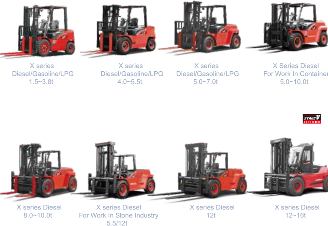
X series Diesel/Gasoline/LPG 1.5-3.8t X series Diesel/Gasoline/LPG 4.0-5.5t X series Diesel/Gasoline/LPG 5.0-7.0t X Series Diesel For Work In Container 5.0-10.0t X series Diesel 8.0-10.0t X series Diesel For Work In Stone Industry 5.5/12t X series Diesel 12t X series Diesel 12-16t